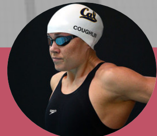
Natalie Coughlin 12 x Olympic Medalist 3 x Olympian Former World Record Holder