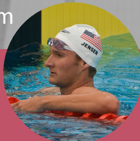
Larsen Jensen 2 x Olympic Medalist Current American Record Holder Former Navy SEAL