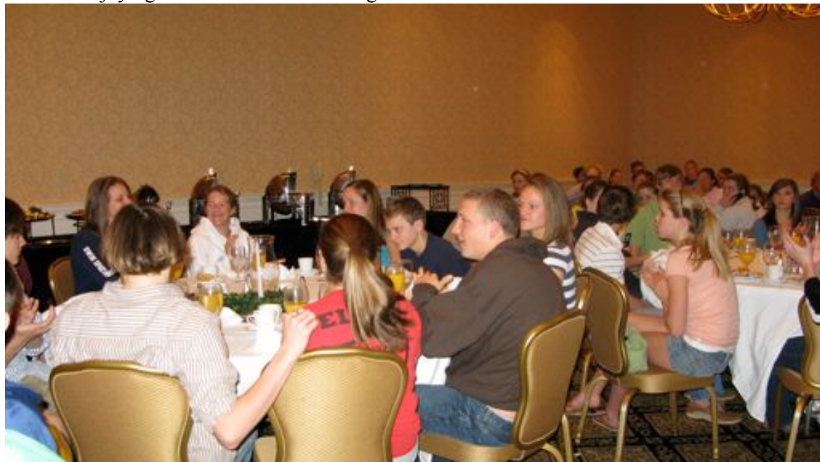
Athletes enjoying breakfast at their meeting.