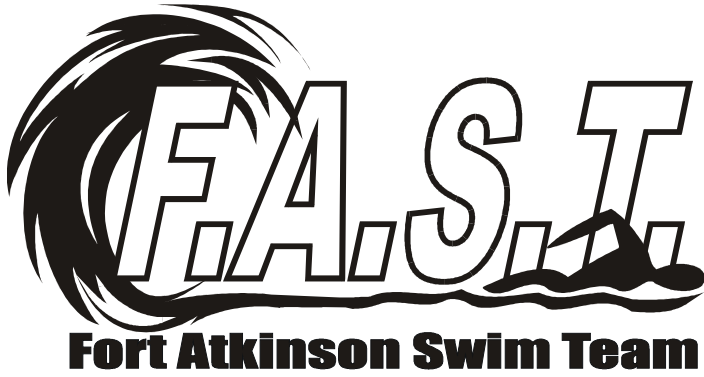
Front Logo - Navy Blue & White Ink

#9) _____ $5.00 Right chest embroidered name (please print)