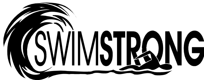
Back Logo - Navy Blue letters