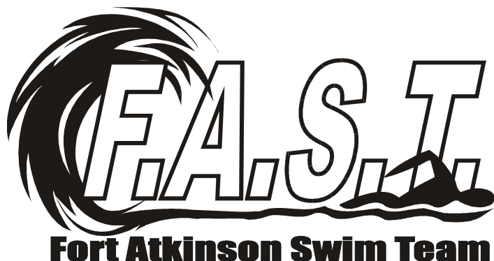
Front Logo - Navy Blue and White Ink

#9) _____ $5.00 Right chest embroidered name (please print)