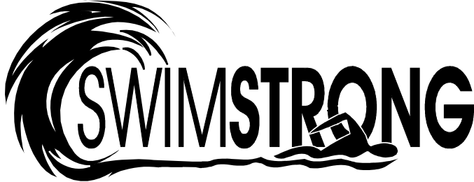
Back Logo - Navy Blue Ink