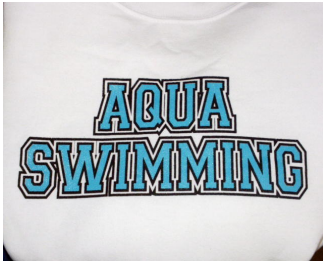
Front-side lettering on sweatshirt and T-shirt

Check out all the new AQUAwear on the team website. The design of a new T-shirt [$9] and sweatshirt [$15-16] was recently finalized. Many of these team items are available at each practice pool and meets, including rear-window decals and team swim caps. All apparel items are provided at cost, so get into short course season by proudly (and economically) displaying your AQUA caps, decals and apparel items.