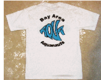
Back design of new T-shirt

Check out all the new AQUAwear on the team website. The design of a new T-shirt [$9] and sweatshirt [$15-16] was recently finalized. Many of these team items are available at each practice pool and meets, including rear-window decals and team swim caps. All apparel items are provided at cost, so get into short course season by proudly (and economically) displaying your AQUA caps, decals and apparel items.