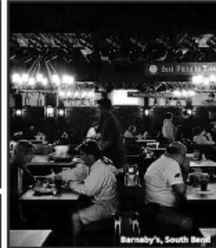
Barnaby's, South Bend