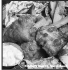
Bruno's Pizza, South Bend