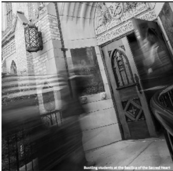
Bustling students at the Basilica of the Sacred Heart