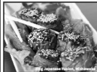
Zing Japanese Fusion, Mishawaka