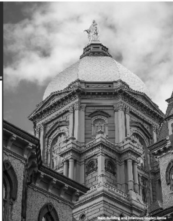
New Building and Infamous Golden Dome