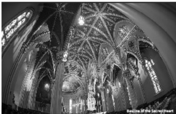
Basilica of the Sacred Heart

Beyond campus, you will find over a dozen museums, plenty of dining and shopping options, and fun events happening all over the rest of the community. We welcome you, and hope you enjoy your stay in South Bend Mishawaka!