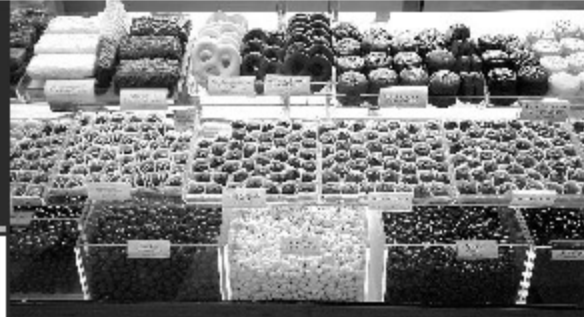
South Bend Chocolate Cafe, South Bend

Want even more suggestions? View the South Bend Area Foodie Trail , brought to you by the editors of Midwest Living , by heading to visitsouthbend.com