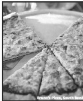
Bruno's Pizza, South Bend