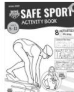
Safe Sport Coloring Book – Ages 5-11 – 10/PK