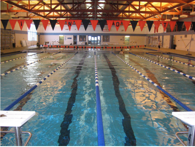
View of the competition pool and warm-up pool from behind the blocks. Plenty of seating on the pool deck for everyone.

The view at the Hardin Community Activity Center pool.