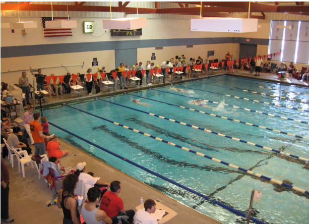
The start/end of the pool during a race. Plenty of deck space.