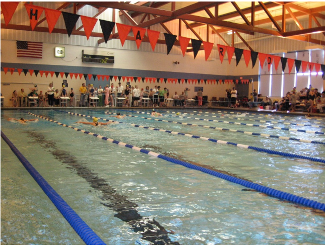
Swimmers racing at a meet.