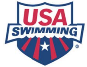
Exhibit A General Event Information