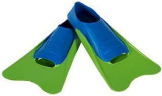
Fins (make sure they are SHORT, for quick kicking)