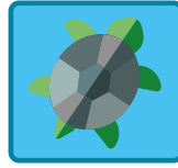
Level 3 TURTLES