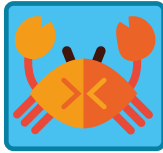
Level 1 CRABS