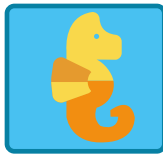
Level 2 SEAHORSES