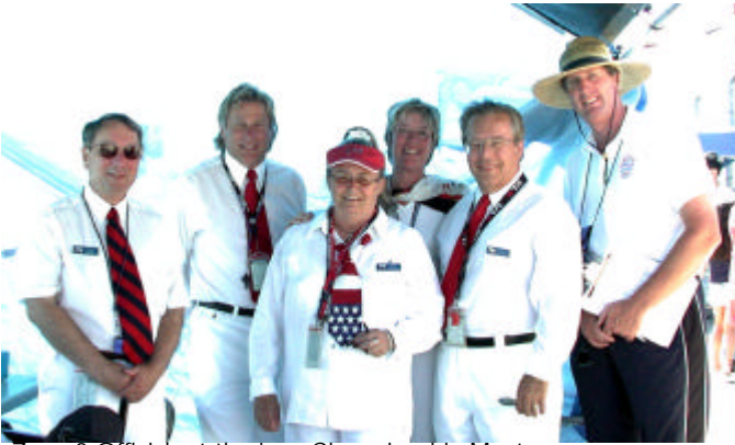
Zone 3 Officials at the June Championship Meet

..“O’er the Land of the Free and the Home of the Brave”