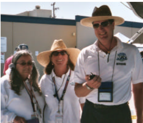
Stroke and Turn Officials - Head Official