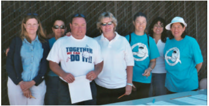
Clerk of Course