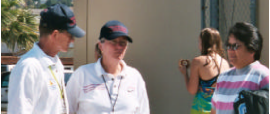
Officials - President of VJO

THANK YOU all who have volunteered for our June swim meets, EVERYONES help is truly appreciated!