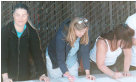
Clerk of Course