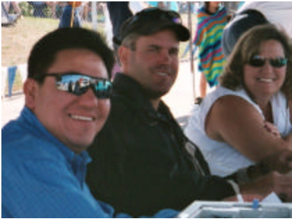
Colorado Timing System