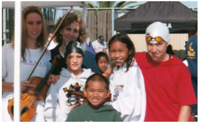
VJO’s National Anthem Violinists with their teacher

..“O’er the Land of the Free and the Home of the Brave”